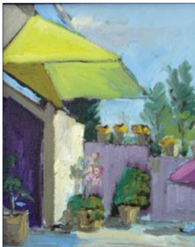
Painting by Mimi Shaw - mimishaw.com

Tiger Mountain Vineyards takes pride in its unusual varietals, all grown and produced in Rabun County at Tiger Mountain. The winery is two and a half miles south of Clayton on Old Highway 441, just 90 minutes northeast of Atlanta. The fine handcrafted wines, which have won more than 125 awards in national and international competitions, are made from French and Portuguese vinifera and one native American grape.